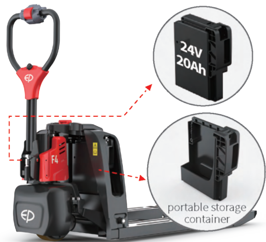
Occasional usage Estimated real life working time: 5.5hrs