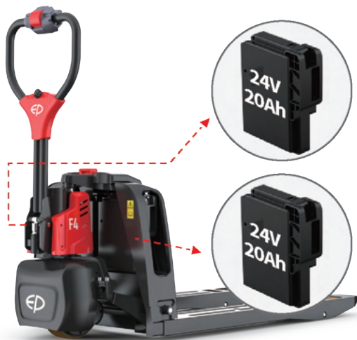
Heavy-duty Estimated real life working time: 11hrs

The VersaTruk 1500 brings maximum flexibility in configurations for every application, from occasional usage to heavy duty. Featuring a two power slot design, VersaTruk offers the option of two 24V/20Ah batteries to maximize runtime for full-time applications. The standard single-battery setting comes with a portable storage container to keep everything easily accessible on the go. Its versatility makes FlexiTruk an all-rounder, perfect for diverse tasks in the most cost effective way.